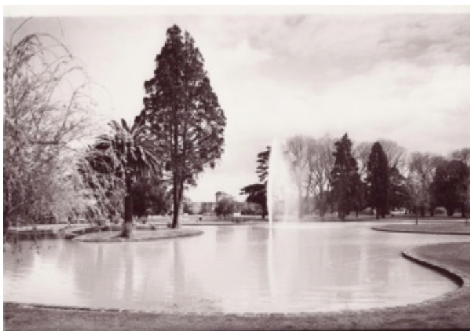
Caulfield Park lake with surrounding trees, c. 1970s.

Trees age and in the opinion of the authorities, interests of public safety require that dangerous trees be culled. In 1995 it was reported that 21 dangerous mature trees had been removed. As reported in the Leader (Jan 16, 1995) "Eucalypt, silky oak and Cyprus trees, some up to 60 years old, had been felled in the eastern end of the park during the past two months" much to the disgust of residents. In 2008 the cypress trees along Inkerman Road were felled. These trees were magnificent and in the eyes of many could have been saved. Tree maintenance had been sorely lacking then, and the Council appeared unaware of the tree treasure trove that should have been preserved. However, the felled trees created an area that could be developed and shortly afterwards, a line of eucalypts was planted along the Inkerman Road side of the park from the depot to Park Crescent.