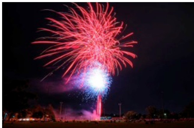
Above: Chanukah Fireworks at Caulfield Park, 1 December, 2013 by Chris Phutully. Photo courtesy of Wikimedia Commons. ♦