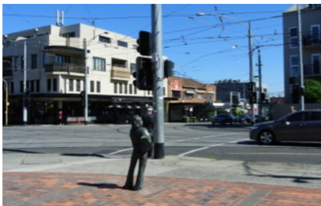
Photo c. 1980

Paper Boy looking towards The Grand Union Tramway Junction, cnr Balaclava and Hawthorn Roads, Caulfield - an example of a complex tram track intersection; the four-way junction allowing trams to turn in any direction, 2018.