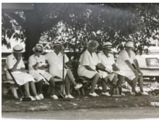
Left: Enjoying the shade at Caulfield Park: Caulfield Park Croquet Club, c.1979.