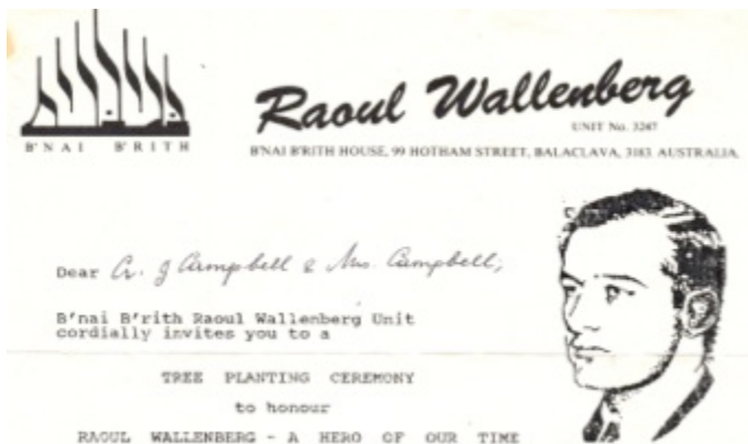
Above: an invitation to a tree planting at Caulfield Park hosted by B'nai B'rith, in honour of Raoul Wallenberg, a Holocaust humanitarian, held on 23 October, 1988.