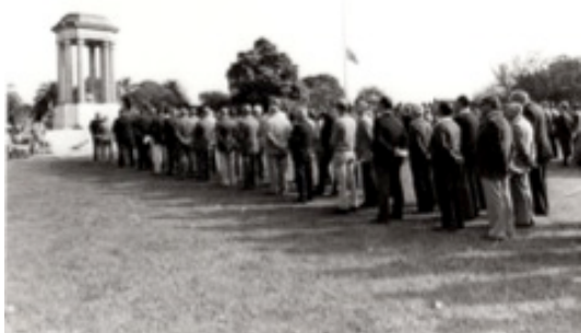
Right: ANZAC Day 1986 at the Caulfield Park Cenotaph.