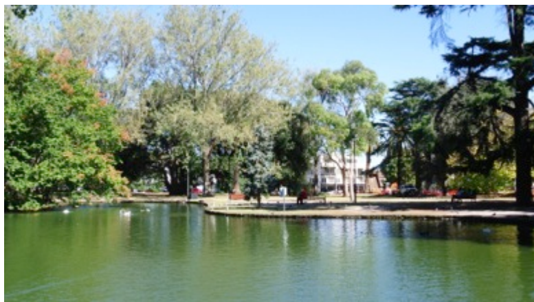
Caulfield Park lake, facing the south-west corner, 2018. GEHS collection.

Developments in the 70s included the conservatory burning down and, although rebuilt, never regaining its former glory. The Lone Pine, the scroll and the amphitheatre all commemorated the First World War and were installed with pomp and ceremony by the armed forces, scouts, etc. The amphitheatre was built but the structure of the amphitheatre was poorly designed. Constructed of bluestone and concrete masonry blocks laid sideways, the concept was to fill the blocks with soil and propagate a vertical garden.