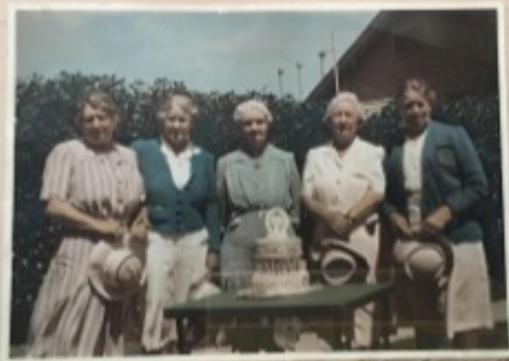
Left: Caulfield Park Croquet Club 25 th anniversary, 8 December, 1948.