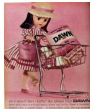
Advertisement for Dawn from the Women's Weekly , 11 March, 1964.

Before the advent of toilet paper everyone had to make do with scraps of newspaper, magazines or even cloth rags when they visited the WC. An early brand of toilet paper, manufactured in Traralgon in the 1950s, was "Dawn".