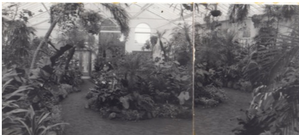
Caulfield Park Conservatory, undated.

can remember taking my own children to play there.