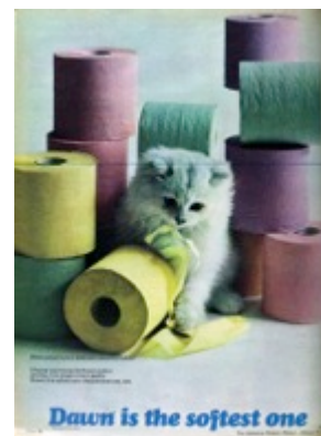
Advertisement for Dawn with the tagline "Dawn is the softest one - the prettiest one too", from the Australian Women's Weekly , 12 February, 1969.