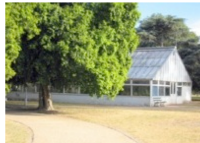
Caulfield Park conservatory, c. 2007.

played every Sunday morning in the bandstand and there were peacocks in the aviary garden which did tend to make a pretty dismal racket. There was only one children's playground with archaic equipment. I