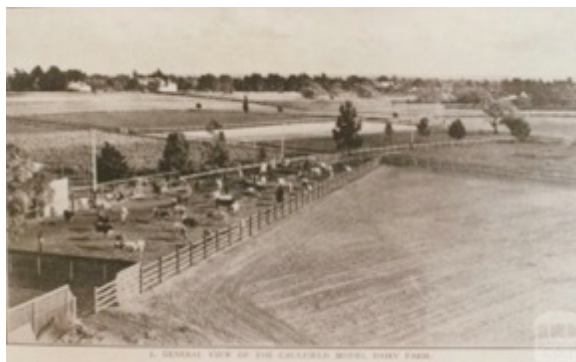
Caulfield model farm, c. 1910.

Cranbourne in 1914. Other dairy bottles were found in the swamp from surrounding suburbs including from Alpha Dairy in Carnegie and Alderney Park Dairy, Brighton.