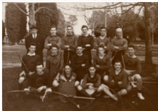
Left: Caulfield Lacrosse Club, Premiers, 1924.