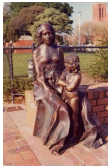
One of the statues, "Mother and Child", cnr Hawthorn and Balaclava Roads, c. 1980.

Within the last 50 years, at the western end of the park, the statues, the lake and the amphitheatre were added although the latter has been removed along with the conservatory. The loss of the conservatory caused the residents great distress. It had been allowed to deteriorate so badly that the council had it removed with a loss of shelter and a very pleasant plant filled haven.