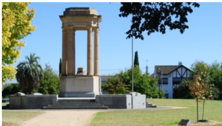
Caulfield Park War Memorial, 2018.

1965: An Aleppo Pine Tree was planted to commemorate the men lost in the Gallipoli campaign. ♦