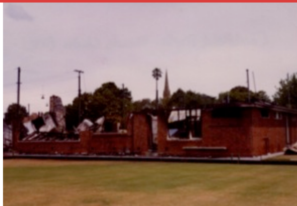
Right: Caulfield Park Bowling Club, after the fire, 1977.