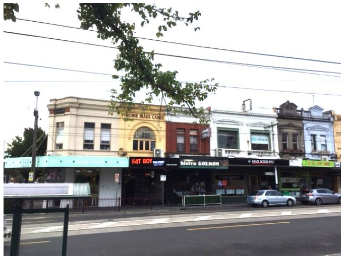
Above: Looking north over the threatened unimpeded view of the parapets of the heritage retail shops along Glen Huntly Road, Elsternwick at Selwyn Street corner.