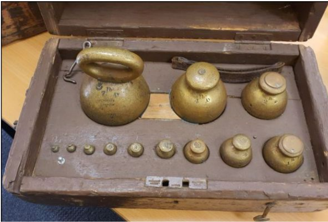
Above: 7lb to half dram. Half dram added to sets in the 1950s