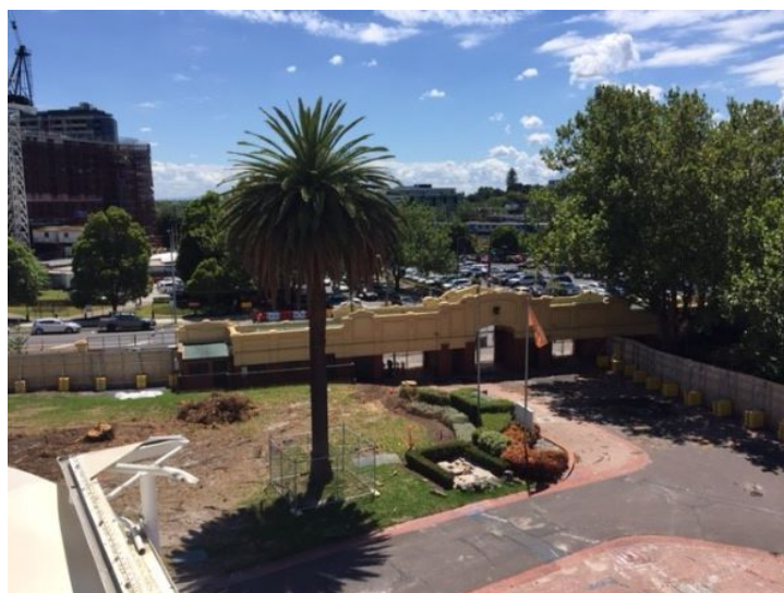
Above: View looking north to Main Entrance from inside Caulfield Racecourse, 5 February 2022