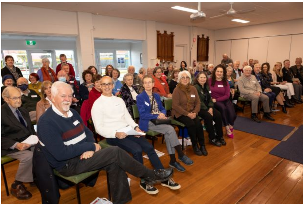
Above: GEHS 50th Anniversary, Murrumbeena Bowls Club, 29 May 2022.