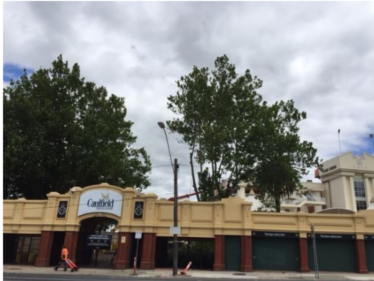
Above: Heritage elm being felled by man in cherry-picker at Main Entrance, Caulfield Racecourse, 18 January 2022