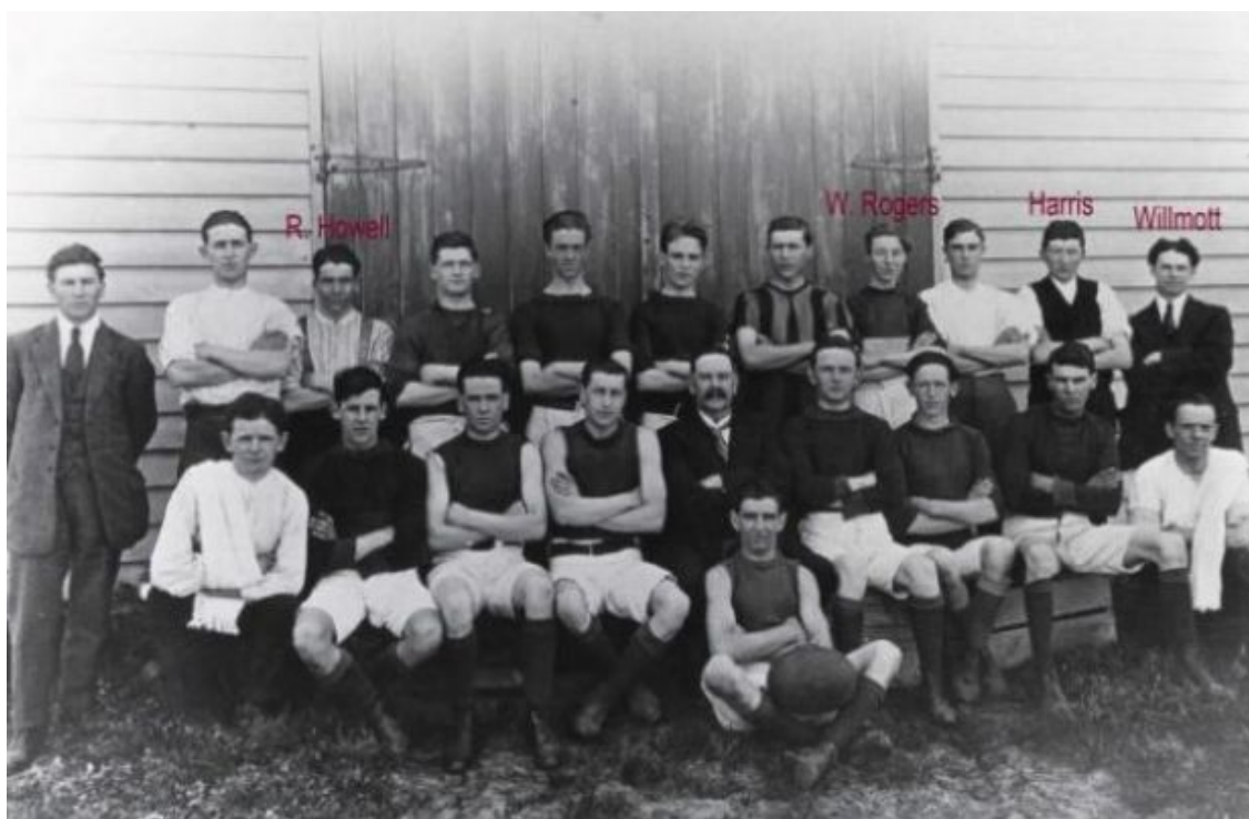
Above: Murrumbeena Football Club, c1920.