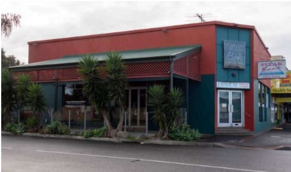
Above: The Steak Bank, Ormond.