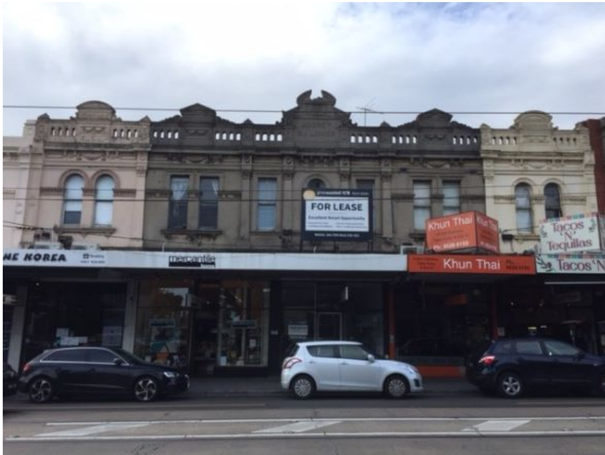
Above: Heritage retail shops including Moore's Buildings on Glen Huntly Road, part of the new Elsternwick Commercial and Public Precinct HO180.