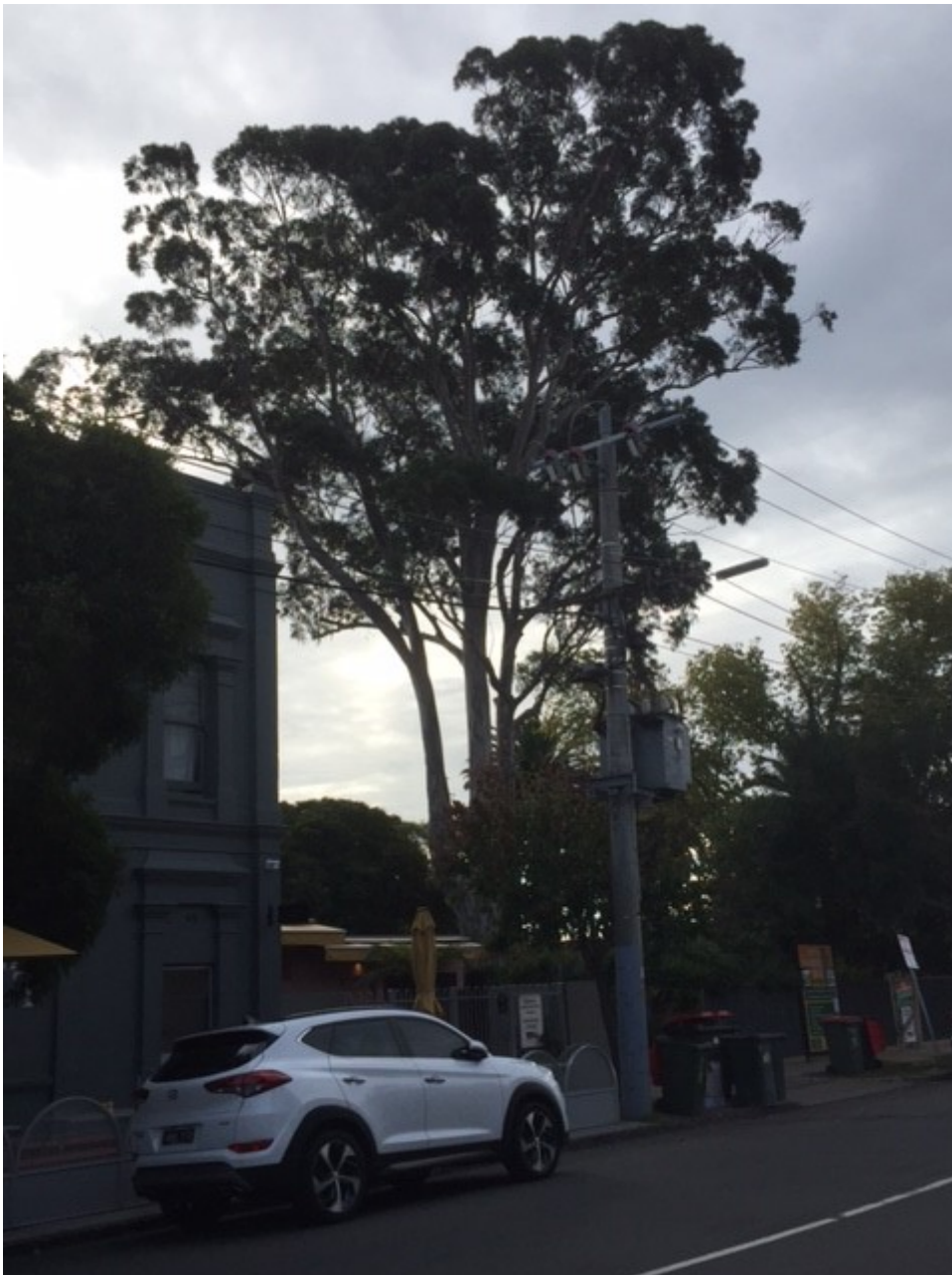
Above: recently added to Classified Tree Register: Sydney Blue Gum, 1 St Georges Road, Elsternwick, 27 April 2022.