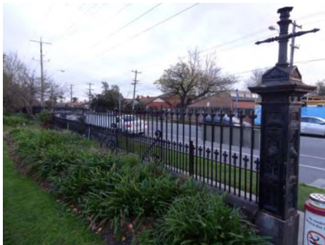
Fence is all that remains of Glen Eira mansion which housed No. 11 AGH. Note the lamp standard on the pillar.

No. 11 AGH grew from the Australian Government's purchase of the 18 room mansion Glen Eira , which was built around 1880 on 27 acres of land. No.11 AGH was established in 1916 and had extensive garden wards and a Red Cross Rest Home. The mansion has been demolished but portions of its wrought iron fence can be seen on Kooyong Road south of the main entrance. The Former Red Cross Rest House is now listed in the Victorian Heritage Register.