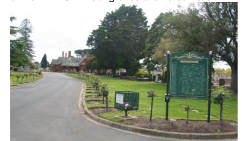
Check the board inside the North Road Entrance for the location of different sections in Brighton Cemetery.

First recorded burial 1855. The cemetery served as a burial place for many World War I returned servicemen who had been hospitalised at No. 11 AGH. Four graves are noted here.